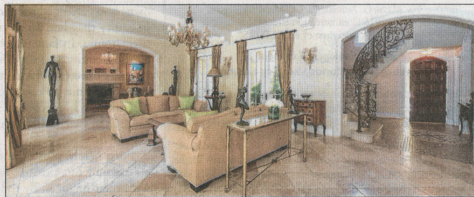
The great room has a fireplace, tray ceilings, gleaming chandeliers and French doors that open to the pool area.