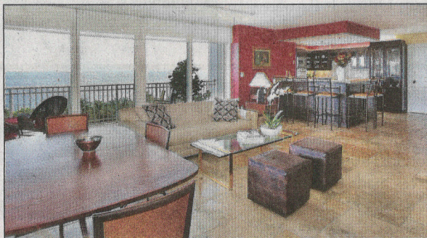
An open kitchen layout enhances the unit's light and airy feel.

The full-service building features 24-hour security and a guard gated entrance, tennis courts, well-appointed gym,