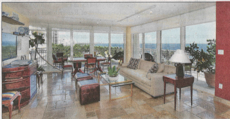
Windows and doors showcase panoramic wraparound views of the ocean, Miami skyline and the beaches.

com or visit property panorama.com/instaview/mia/A10023928 .