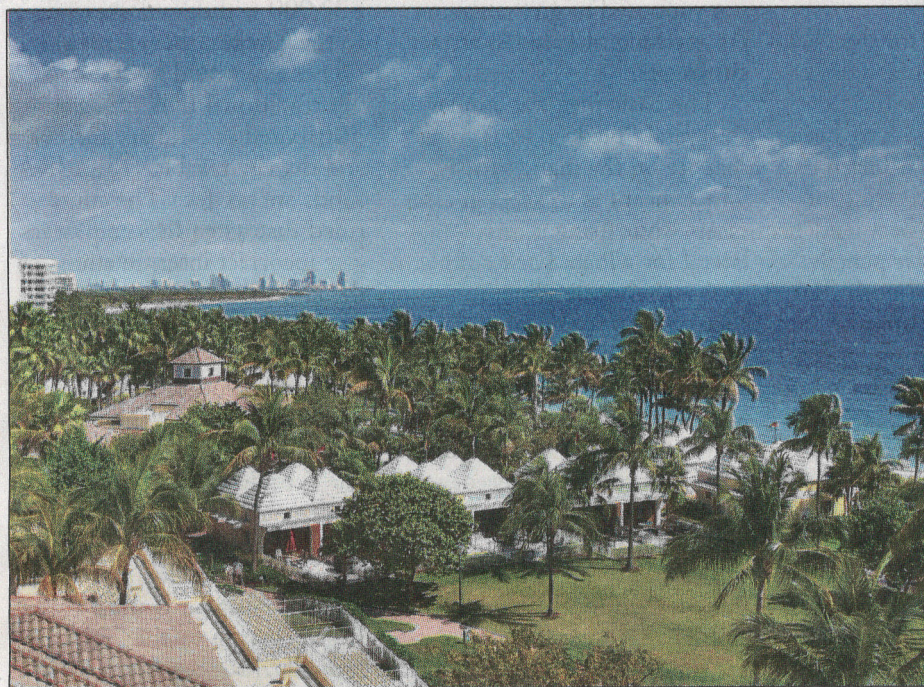
The four-bedroom, three-bath corner unit is in Key Biscayne's Casa del Mar Condominium.

SPECIAL REAL ESTATE SECTION • SATURDAY, APRIL 2, 2016