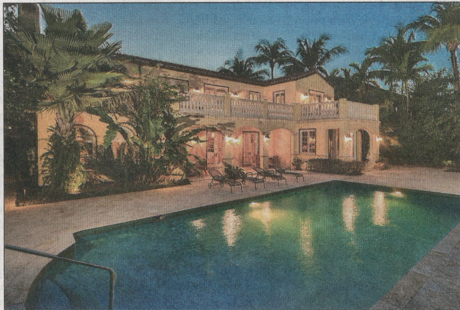
The 20,394-square-foot verdant lot is anchored by a gracious covered patio, deck and luxurious pool.